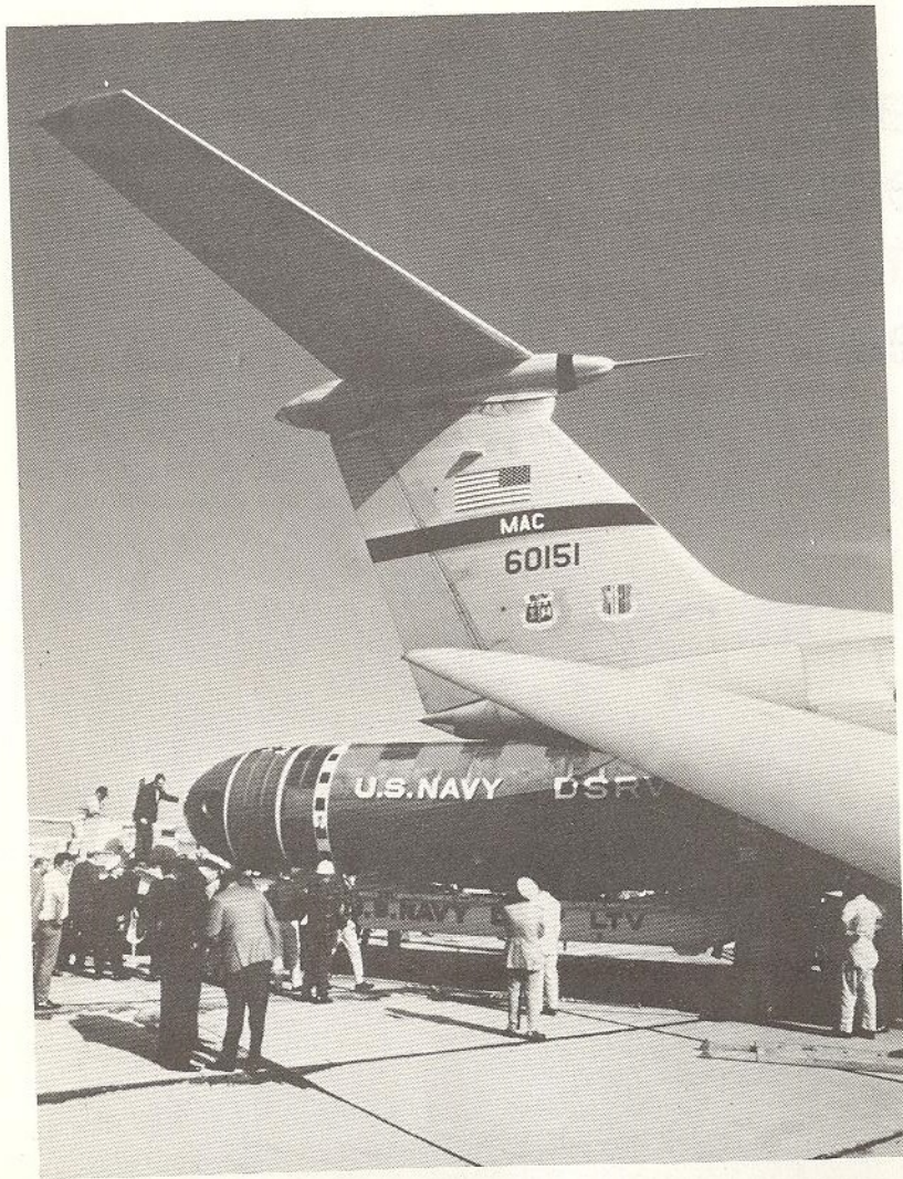
DSSV-1 going aboard transport aircraft.